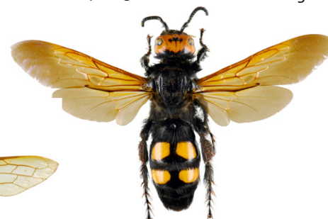
Mammoth wasp, Megascolia maculata

The Giant Woodwasp , Urocerus gigas , is a sawfly whose larva feed on wood. This black and yellow banded wasp can be easily distinguished from a hornet by its cylindrical body and its long and entirely yellow antennae. The female can reach 45mm in length and has a long ovipositor to lay its eggs in tree trunks. This species is totally harmless.