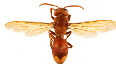
Oriental hornet, Vespa orientalis

Wasps are smaller than hornets. The workers measure about 15mm in late summer. Be aware that a queen wasp may slightly exceed 20mm, i.e., the size of the Asian hornet shown here, without the head. In spring, wasps may therefore be larger than the earliest hornet workers.