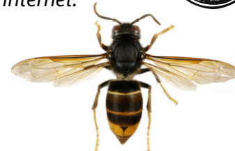
Yellow-legged hornet/Asian hornet, Vespa velutina

The European hornet , Vespa crabro , has a predominantly pale yellow abdomen, with black stripes. Its head is yellow from the front and red from above. Its thorax and legs are black and reddish-brown. Workers measure between 18 and 23mm and queens between 25 and 35.