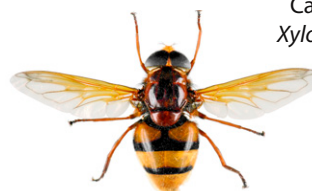
Hornet mimic hoverfly, Volucella zonaria

The Blue Carpenter bee , Xylocopa violacea , measures 20-30mm; it is fully black with purple-blue relexions. The female of this solitary bee builds its nest in rotten dead wood and collect pollen to feed its larvae.