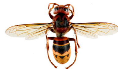
European hornet, Vespa crabro

The Oriental hornet , Vespa orientalis , is the same size as the European hornet. It is entirely red, only its head from the front and a band of its abdomen are yellow. It is only present in the south-east Europe (south Italy, Malta, Albania, Greece, Cyprus, Romania, Bulgaria).