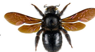
Carpenter bee, Xylocopa violacea

The Blue Carpenter bee , Xylocopa violacea , measures 20-30mm; it is fully black with purple-blue relexions. The female of this solitary bee builds its nest in rotten dead wood and collect pollen to feed its larvae.